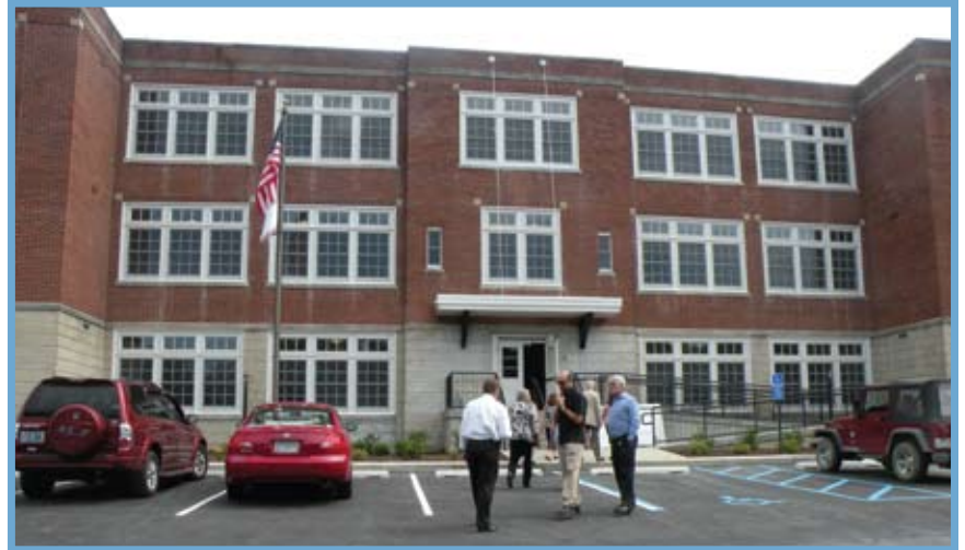
Beattyville School Apartments, one of FAHE Capital's recent LIHTC properties.

This June, FAHE Capital will begin offering its third tax credit fund in Kentucky. This new fund will continue to give investors the opportunity to help provide affordable housing, gain CRA credit, and earn an attractive after-tax return by investing in properties that produce Low-Income Housing Tax Credits. The Low-Income Housing Tax Credit (LIHTC) program provides a federal tax credit for up to 90% of the eligible costs of affordable rental